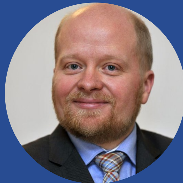
Ólafur Einarsson, Registrar EFTA Court