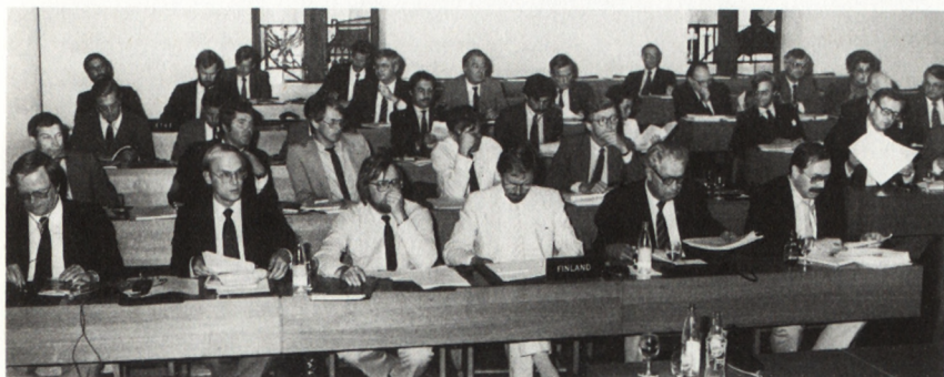
General view of the Consultative Committee meeting in St. Gall on 10-11 September 1984.

conclusions of that meeting and on general features of the world economic situation.