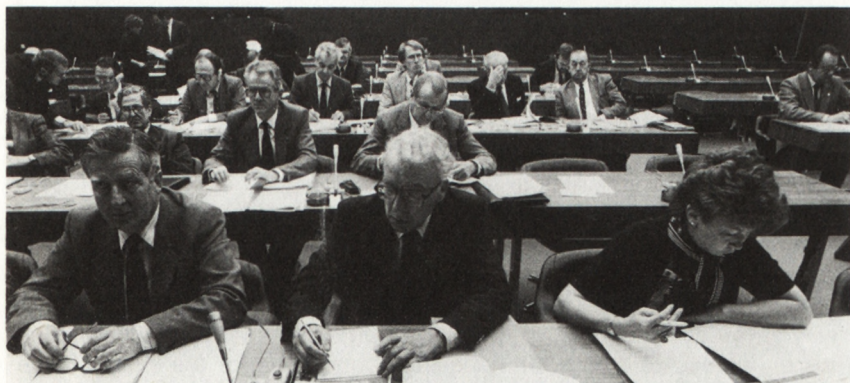
General view of the Consultative Committee meeting with the Economic and Social Committee of the EC in Berne, on 18 and 19 October 1984.

chairman. The Committee has a consultative role within EFTA and serves as a channel of communication between the Councils and parliamentarians in the EFTA countries.