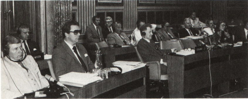
General view of the meeting of Members of Parliament in Vienna on 3 and 4 May 1984.

operates but made some proposals to improve the preparations for meetings.