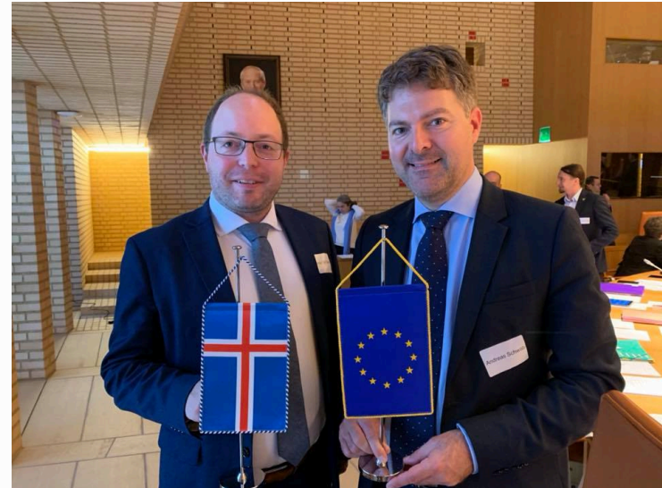
EEA JPC Chair and Vice-chair meet at the 53rd EEA JPC meeting in Vaduz on 30 October 2019.